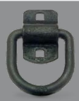
DR-050 1/2" FORGED D-RING W/ BOLT-ON CLIP