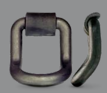
DR-100L-B 1" FORGED BENT D-RING W/ WELD -ON CLIP