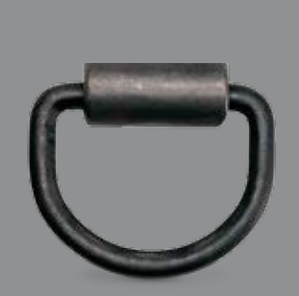
DR-038-WLD 3/8" forged d-ring w/ weld-on clip