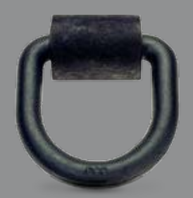
DR-062 5/8" FORGED D-RING W/ WELD-ON CLIP