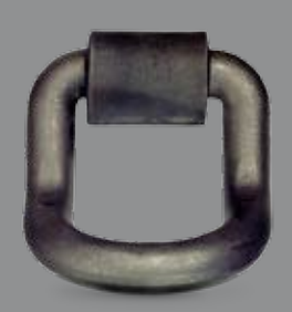
DR-075-B 3/4" FORGED BENT D-RING W/ WELD-ON CLIP