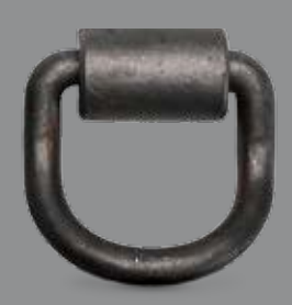
DR-062-B 5/8" FORGED BENT D-RING W/ WELD-ON CLIP