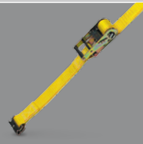
2350-12-SE 2" X 12' SERIES E OR A RATCHET STRAP W/SPRING E FITTINGS