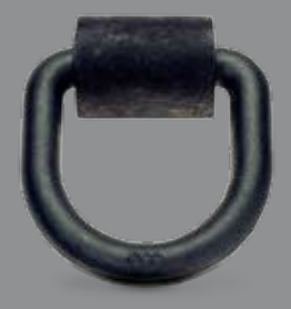
DR-075 3/4" FORGED D-RING W/ WELD-ON CLIP