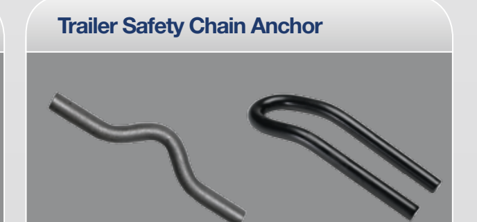
CH-038-UP class iii safety chain anchor point