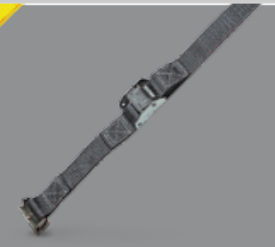
2360-16-SE 2" X 16' SERIES E OR A CAM STRAP W/SPRING E FITTINGS