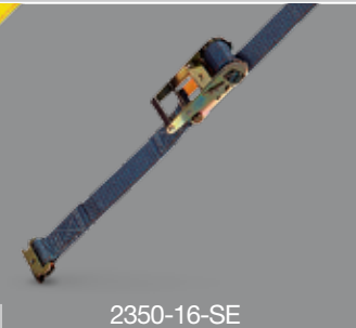
2" X 16' SERIES E OR A RATCHET STRAP W / SPRING E FITTINGS